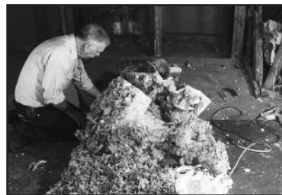
Walls go down and the diorama moves out as part of the renovation project.